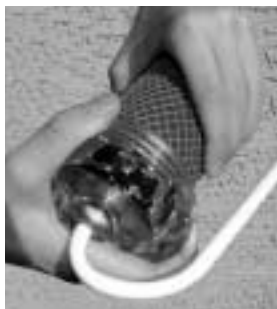
Figure 18 Installing the filter into the cap